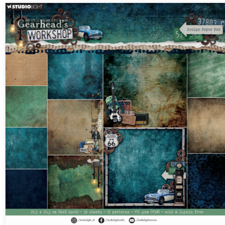
SL-GW-DPP470 | 203x203mm