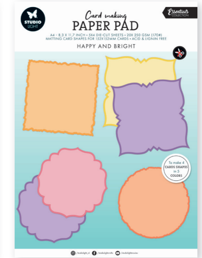
SL-ES-CMP30 | 210x297mm