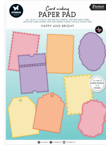
SL-ES-CMP28 | 210x297mm