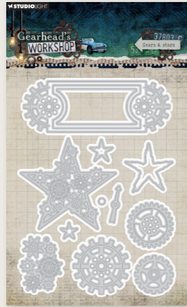
SL-GW-CD1106 | 99x138mm