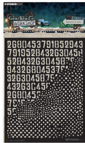
SL-GW-MASK400 | 115x148mm