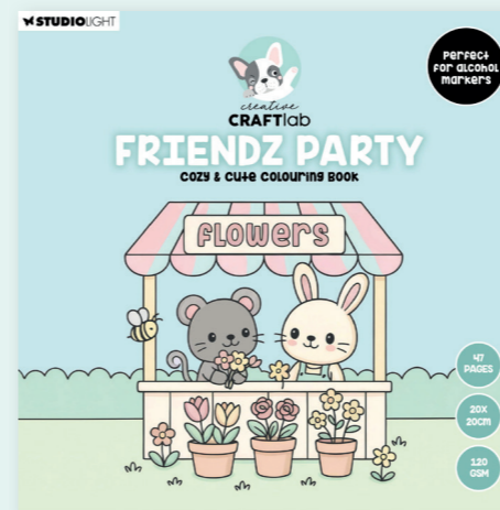
CCL-FR-CB07 | 200x200mm