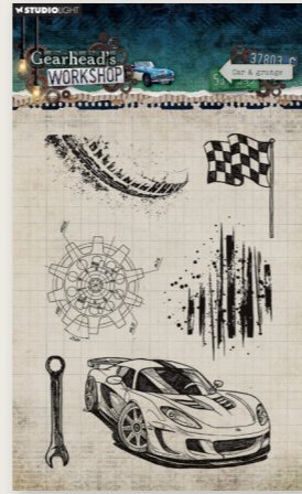
SL-GW-STAMP945 | 93x136mm