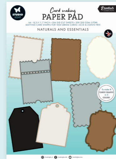
SL-ES-CMP31 | 210x297mm