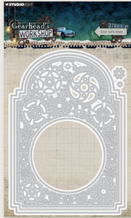
SL-GW-CD1105 | 105x148mm