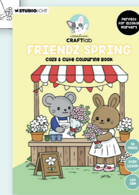
CCL-FR-CB09 | 105x148mm