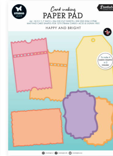
SL-ES-CMP29 | 210x297mm