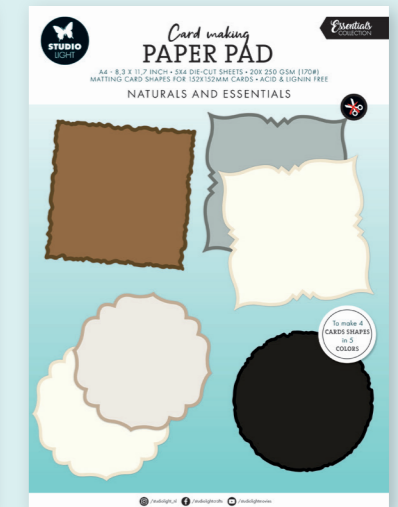
SL-ES-CMP33 | 210x297mm