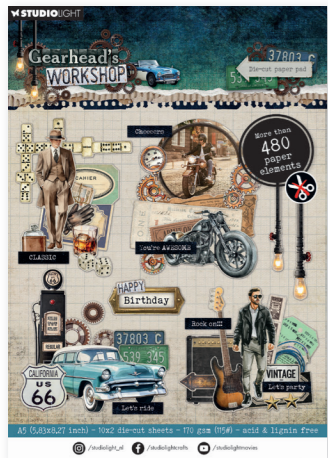
SL-GW-DCPP469 | 148x210mm