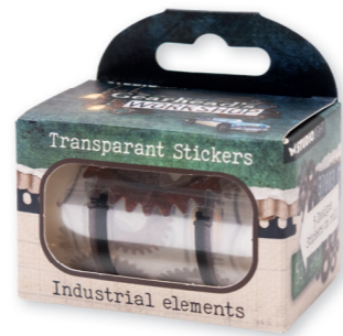
SL-GW-STIC73 | 65x45x45mm