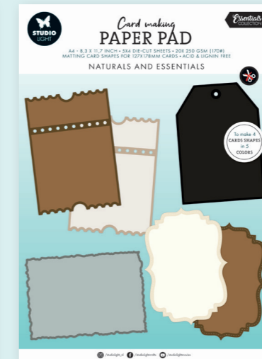
SL-ES-CMP32 | 210x297mm