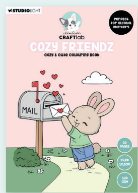
CCL-FR-CB11 | 105x148mm