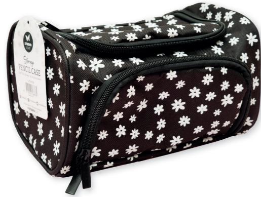
SL-TO-PC08 | 220x115x120mm