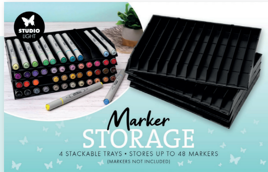
SL-TO-STOR15 | 245x155x55mm

A smart and practical storage solution for markers. This set includes four sturdy stackable trays that hold up to 48 markers, keeping them neatly aligned and easy to access.