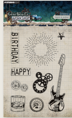
SL-GW-STAMP944 | 93x136mm