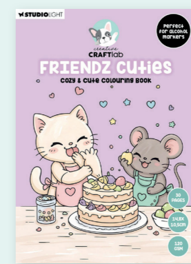
CCL-FR-CB10 | 105x148mm