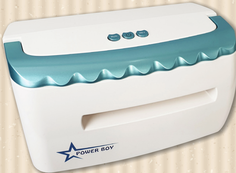
EPB002 Electric A5 Diecutting and embossing machine