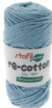
20 babyblau | blu baby | blue baby | bleu baby