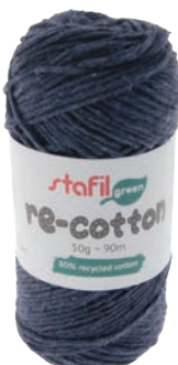
10 indigoblau | indaco | indigo | indigo