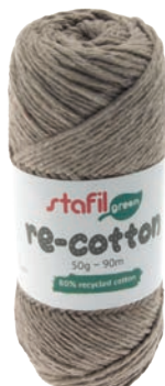
06 Kaffee | caffè | coffee | café