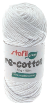
01 weiß | bianco | white | blanc