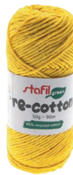
17 gelb | giallo | yellow | jaune