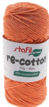
23 orange | arancione | orange orange