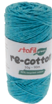
21 türkisblau | blu turchese | turquoise | turquoise