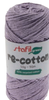
13 violett | viola | violet | violet