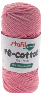
16 rosarot | rosa | rose | rose