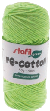
18 hellgrün | verde chiaro | light green | vert clair