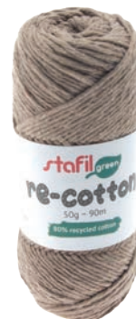
04 kamel | cammello | camel | chameau