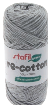
07 Stein | pietra | stone | pierre