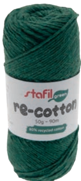
22 dunkelgrün | verde scuro | dark green | vert foncé