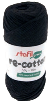
24 schwarz | nero | black | noir