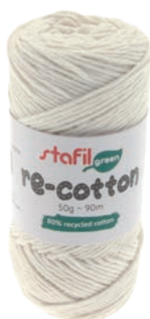
02 creme | crema | cream | crème