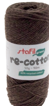
09 dunkelbraun | marrone scuro dark brown | brun foncé