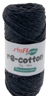
12 anthrazit | antracite | anthracite anthracite