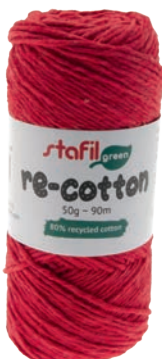
14 rot | rosso | red | rouge