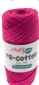
15 pink | pink | pink | anthraci