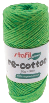
19 grün | verde | green | vert clair