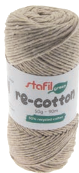
03 beige | beige | beige | beige