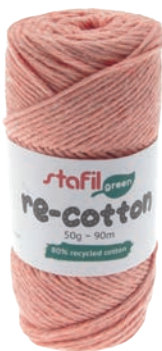
05 pfirsich | pesca | peach | pêche