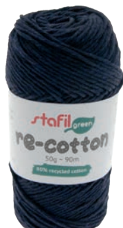
11 blau melange | blu melange blue melange | bleu melange