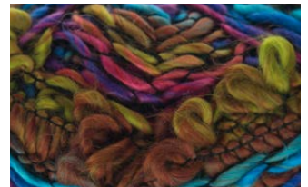
9 türkis/lila/hellgrün | turchese/viola/verdino | turquoise/purple/light green | turquoise/violet/vert clair