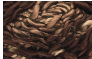
8 beige/mittel/dunkelbraun | beige/marrone medio/scuro | beige/medium/dark brown | beige/moyen/brun foncé