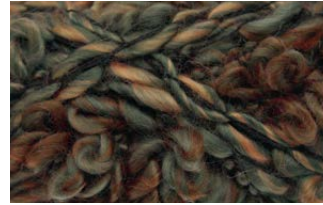
3 lila/beige/braun | viola/beige/marrone | purple/beige/brown | violet/beige/brun