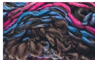
20 lila/mittelblau/dunkelgrau | viola/blu medio/grigio scuro | purple/medium blue/dark gray | violet/bleu moyen/gris foncé