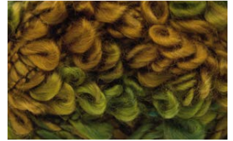
6 braun/kiwi/dunkelgrün | marrone/kiwi/verde scuro | brown/kiwi/dark green | marron/kiwi/vert foncé