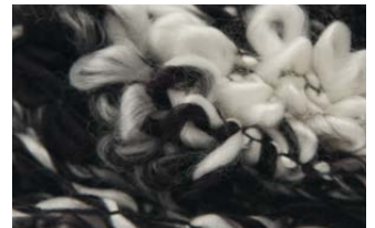
12 weiß/schwarz | bianco/nero | white/black | blanc/noir