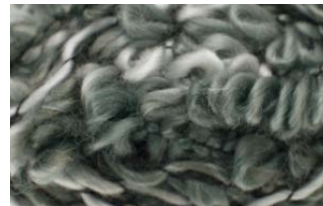
10 weiß/hellgrau/dunkel | bianco/grigio chiaro/scuro | white/light gray/dark | blanc/gris clair/foncé